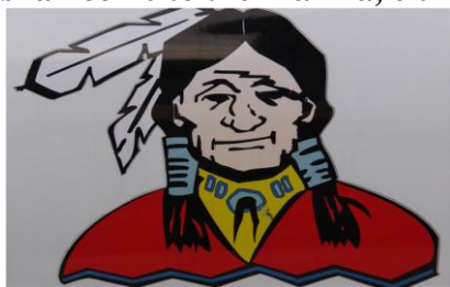
YESTER's Home repairs/Construction INC.